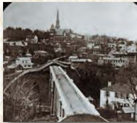
1 THE OLD CROTON AQUEDUCT PROMENADE EL PASEO DEL VIEJO AQUEDUCTO CROTON