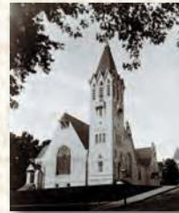
8 THE UNITED METHODIST CHURCH LA IGLESIA METODISTA UNIDA