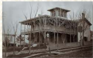
11 ELLIS PLACE AND THE LITTLE SHOP TEA ROOM ELLIS PLACE Y EL SALÓN DE TÉ LA TIENDITA