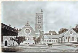
12 TRINITY EPISCOPAL CHURCH IGLESIA EPISCOPAL TRINITY