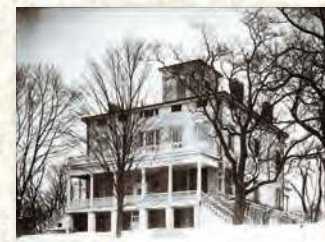
25 THE SMITH-ROBINSON HOUSE LA CASA SMITH-ROBINSON