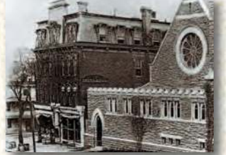
13 GEORGE ROHR'S SALOON AND BOARDING HOUSE TABERNA Y PENSIÓN DE GEORGE ROHR