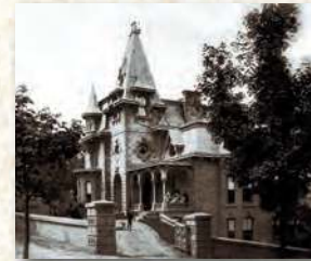
7 HIGHLAND COTTAGE (SQUIRE HOUSE – MUD HOUSE) CABAÑA HIGHLAND (CASA SQUIRE – CASA DE BARRO)