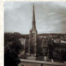
22 THE CALVARY BAPTIST CHURCH AND ANNEX LA IGLESIA BAUTISTA CALVARY Y ANEXO