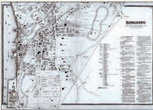
1868 Map of Sing Sing.

The community prospered as a port, with most of its settlement on the riverfront. On April 2, 1813, Sing Sing became the first incorporated village in Westchester County. In 1825, the Village was chosen as the site of the Mount Pleasant State Prison, due to its proximity to New York City (prisoners were sent “up the river”) and large quantity of white limestone. This stone became known as Sing Sing Marble, and was used for buildings, walls and other products. In 1851, the State gave the prison the same name as the village: Sing Sing.