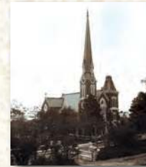
6 THE FIRST PRESBYTERIAN CHURCH LA PRIMERA IGLESIA PRESBITERIANA