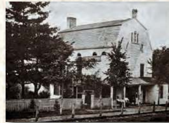
5 THE CYNTHARD BUILDING EL EDIFICIO CYNTHARD