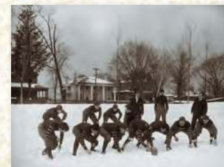
24 THE JAMES ROBINSON HOUSE LA CASA JAMES ROBINSON