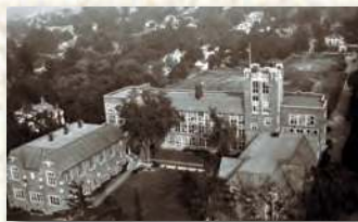
10 OSSINING HIGH SCHOOL EL COLEGIO OSSINING