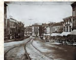
19 THE OSSINING NATIONAL BANK EL BANCO NACIONAL DE OSSINING