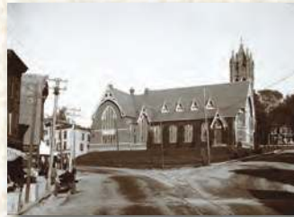
4 THE FIRST BAPTIST CHURCH LA PRIMERA IGLESIA BAUTISTA