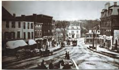
2 THE CRESCENT LA MEDIA LUNA