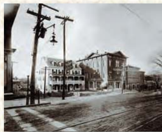
17 VILLAGE OF OSSINING COMMUNITY CENTER – WESKORA HOTEL CENTRO COMUNITARIO DE LA VILLA DE OSSINING – HOTEL WESKORA