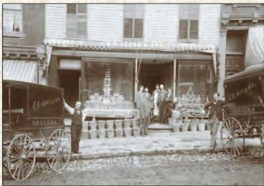
E.O. Secor and Son grocery store on lower Main Street.