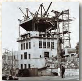
16 THE FIRST NATIONAL BANK AND TRUST CO. EL PRIMER BANCO Y COMPAÑIA FIDUCIARIA NACIONAL