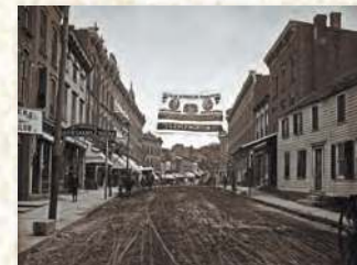
20 LOWER MAIN STREET OSSINING OSSINING DE LA CALLE LOWER MAIN