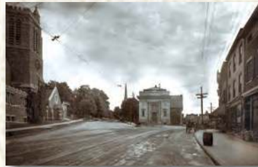
3 THE OSSINING BANK FOR SAVINGS EL BANCO DE AHORROS DE OSSINING