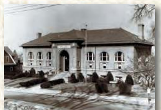
15 THE CARNEGIE LIBRARY LA BIBLIOTECA CARNEGIE