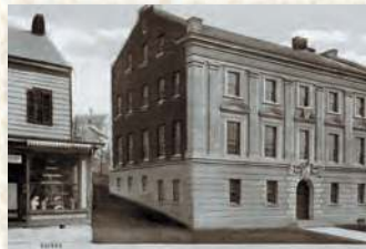
14 THE VILLAGE OF OSSINING MUNICIPAL BUILDING EDIFICIO MUNICIPAL DE LA VILLA DE OSSINING