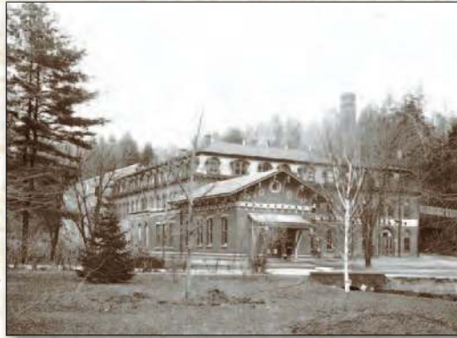
Brandreth Pill Factory.