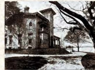
21 BELLA VISTA AND THE SECOR ROAD STONE WALL BELLA VISTA Y LA PARED DE PIEDRA DE SECOR ROAD