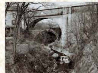
18 THE DOUBLE ARCH EL DOBLE ARCO